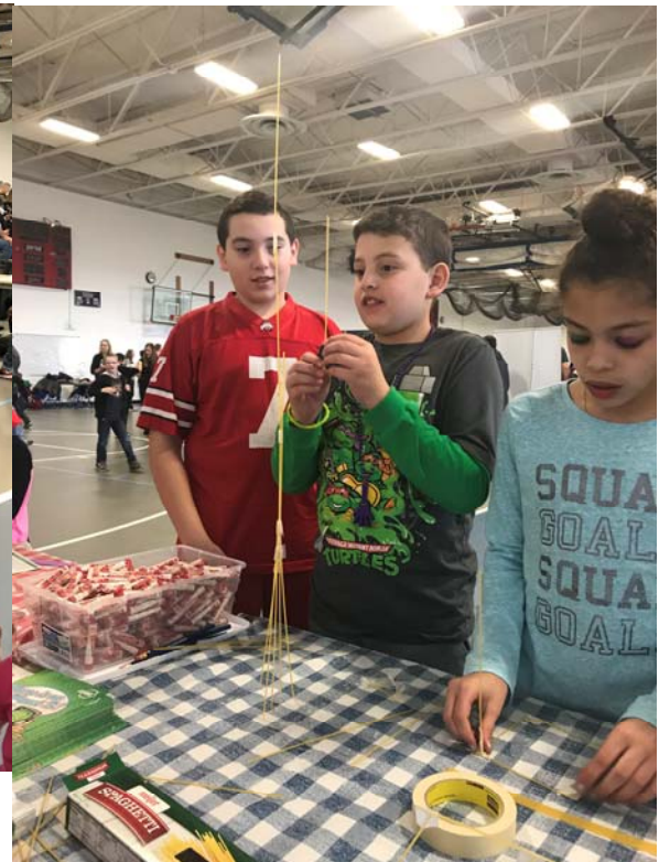
Students Executing a Spaghetti tower